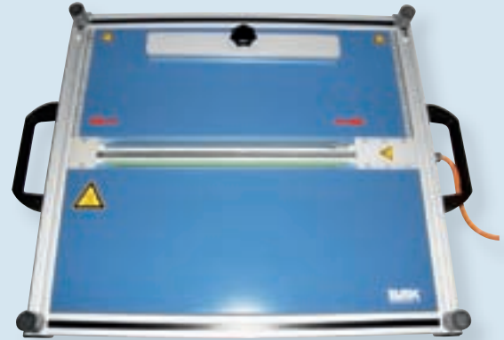
Mini heat batten